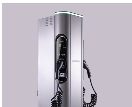
With spiral cable as an option