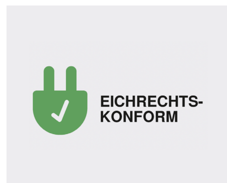
Compliant with calibration law as standard