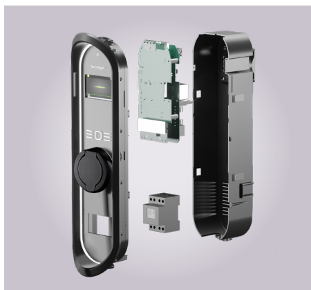
Technagon charging module (calibration law compliant)