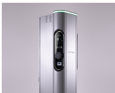
With charging socket as standard