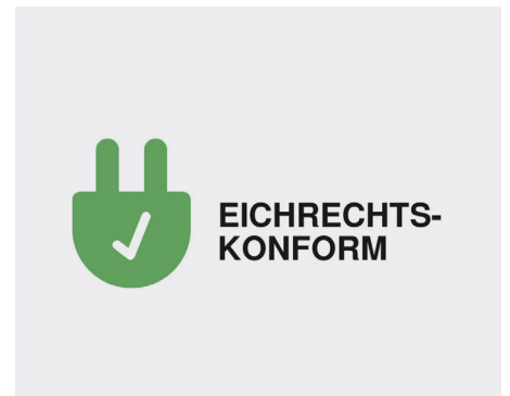
Compliant with calibration law as standard