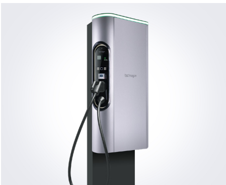
Standard version Cable length: 3m