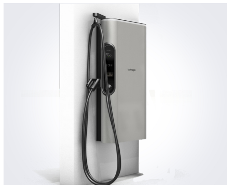
With cable management as an option Cable length: 5.5m